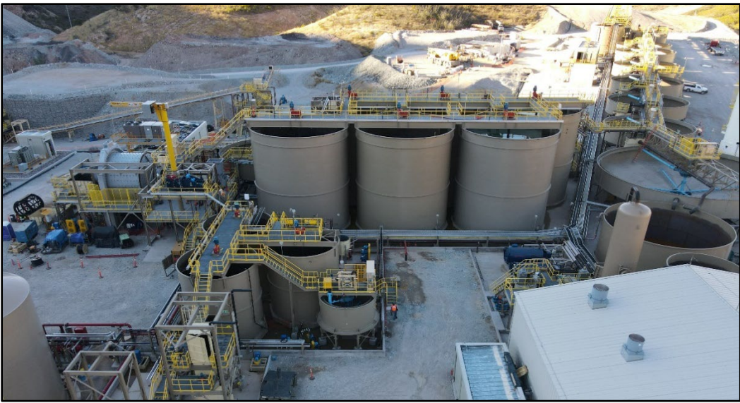
Figure 4: Leach Tank Construction