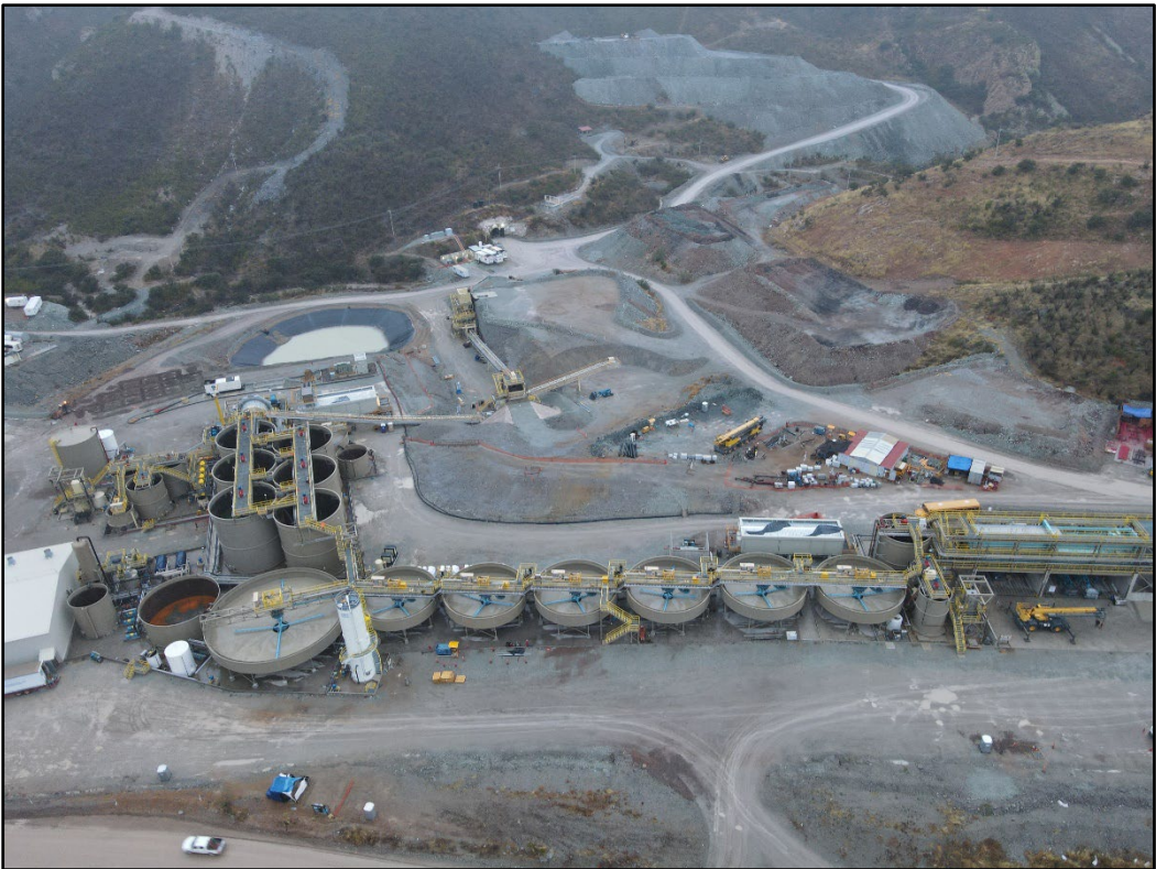
Figure 2: Overview of Process Plant Area