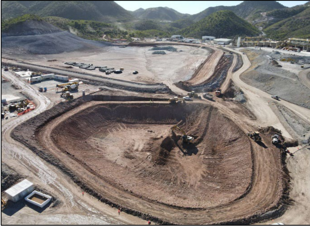
Figure 11: Filtered Tailing Facility