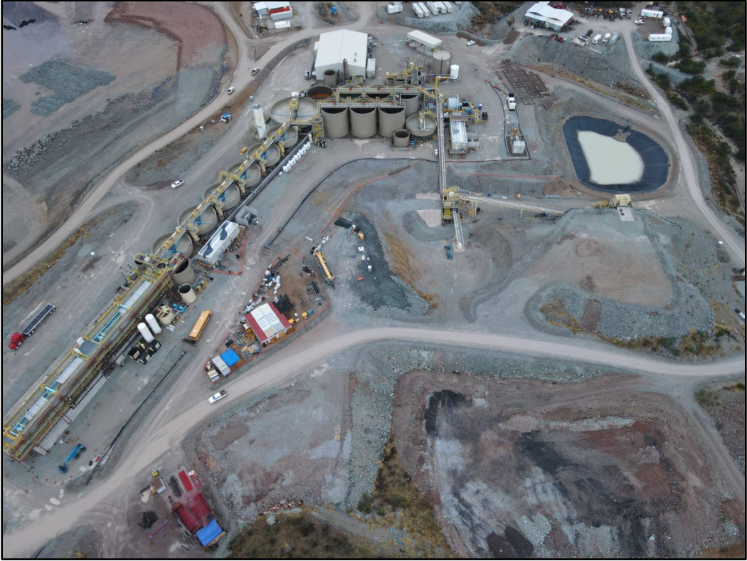
Figure 1: Drone Image of Process Plant Construction and Stockpiles