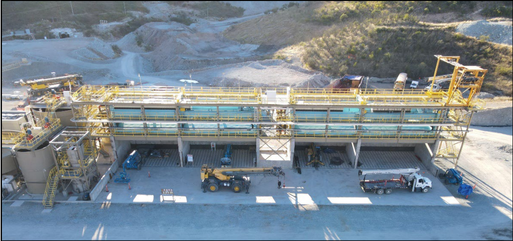
Figure 3: Filter Construction