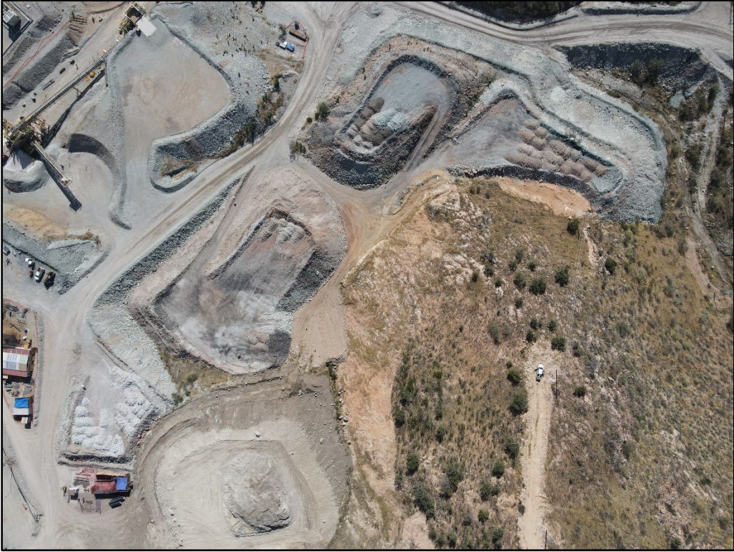
Figure 9: Stockpiles