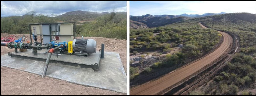
Figure 10: Pumping Station