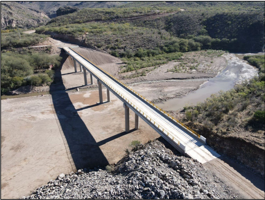
Figure 6: Bridge Construction