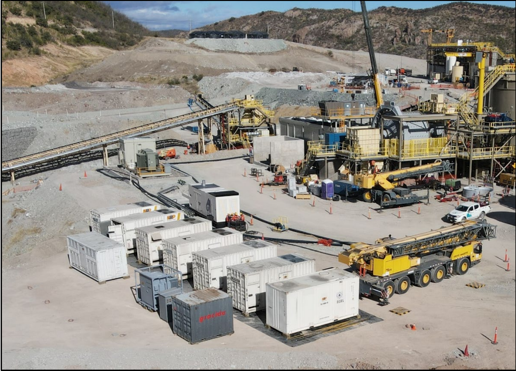
Figure 5: Temporary Diesel Generators