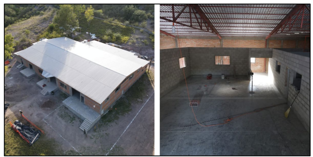
Figure 9: Assay Lab