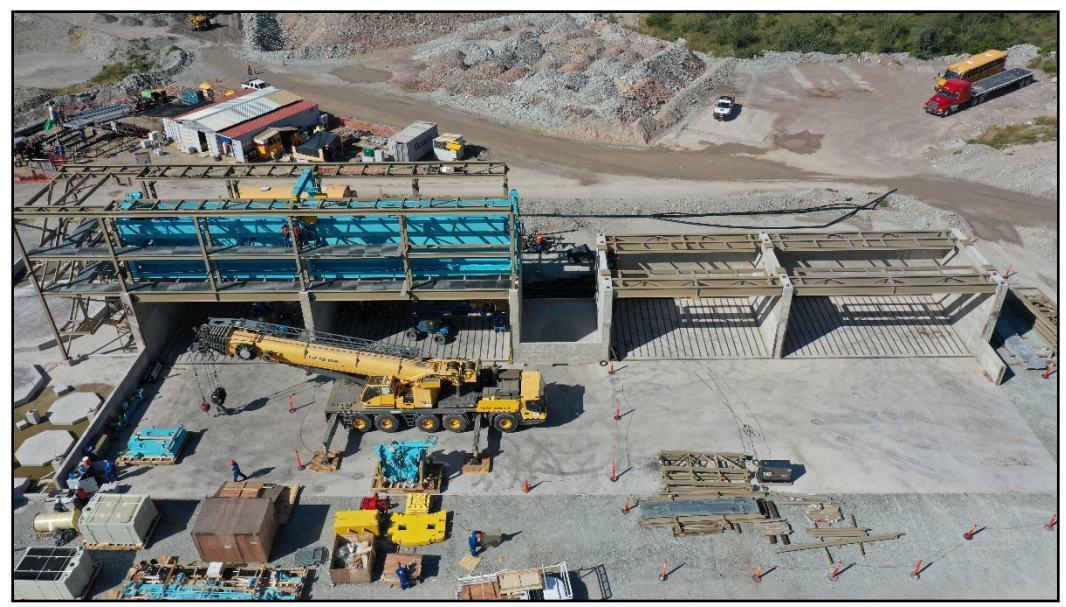
Figure 3: Filter Construction