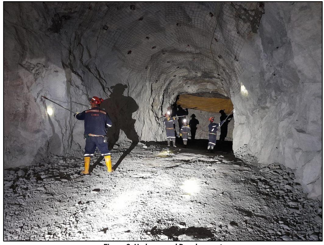
Figure 8: Underground Development