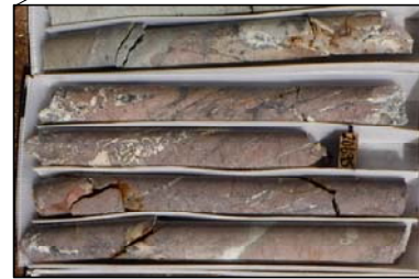
Hole LC17-37; 2.3m @ 845 AgEq**